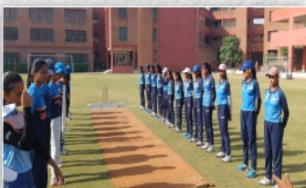
HCLF Cricket SDC Girls - Friendly Match