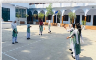
Talim Gaaah Niswan Inter College, Lucknow