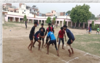
Ramadhin Singh Inter College SDC for Kabaddi - Boys

1300+ sessions / 3000+ hours of sports coaching across 12 SDCs in Noida and Lucknow for Athletics, Volleyball, Football, Cricket, and Kabaddi