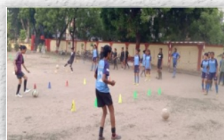
GGIC Gomtinagar SDC for Football - Girls