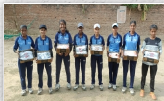
Students with Sports Kits

Provided Nutrition & Sports kits to 250+ athletes