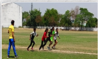
District Level - Lucknow

Special Training Sessions by expert coaches for selected players