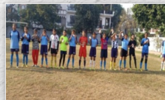
Regular Nutrition for SDC Students